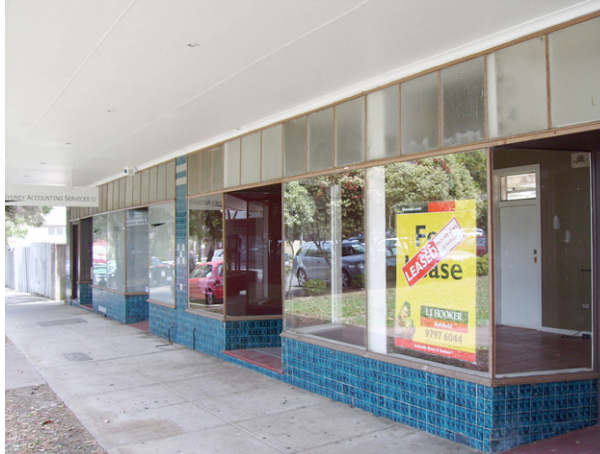
Figure 28.18. Detailed shopfront to Loftus Street showing original tiled façade and glazed shopfronts.