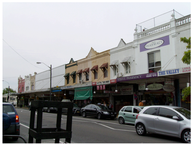
Figure 28.11 demonstrates the important contribution that repetition and rhythm can make to the creation of aesthetically interesting retail streetscapes, even if only through the very simple device of a basic hood and consistent window placement.