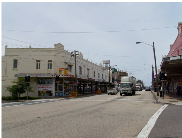
Figure 28.15 New Canterbury Road demonstrates a consistent parapet and skyline.