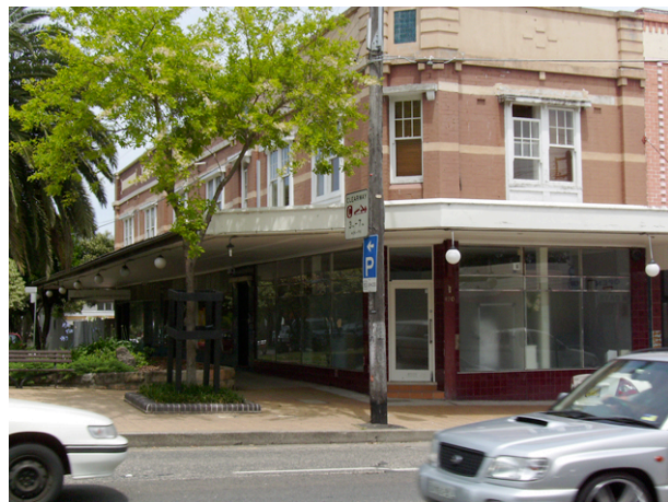
Figure 28.5 and 28.6. This small group of shops overlooks a park created by a street closure of Loftus Street and contributes to the aesthetic values of the Area.