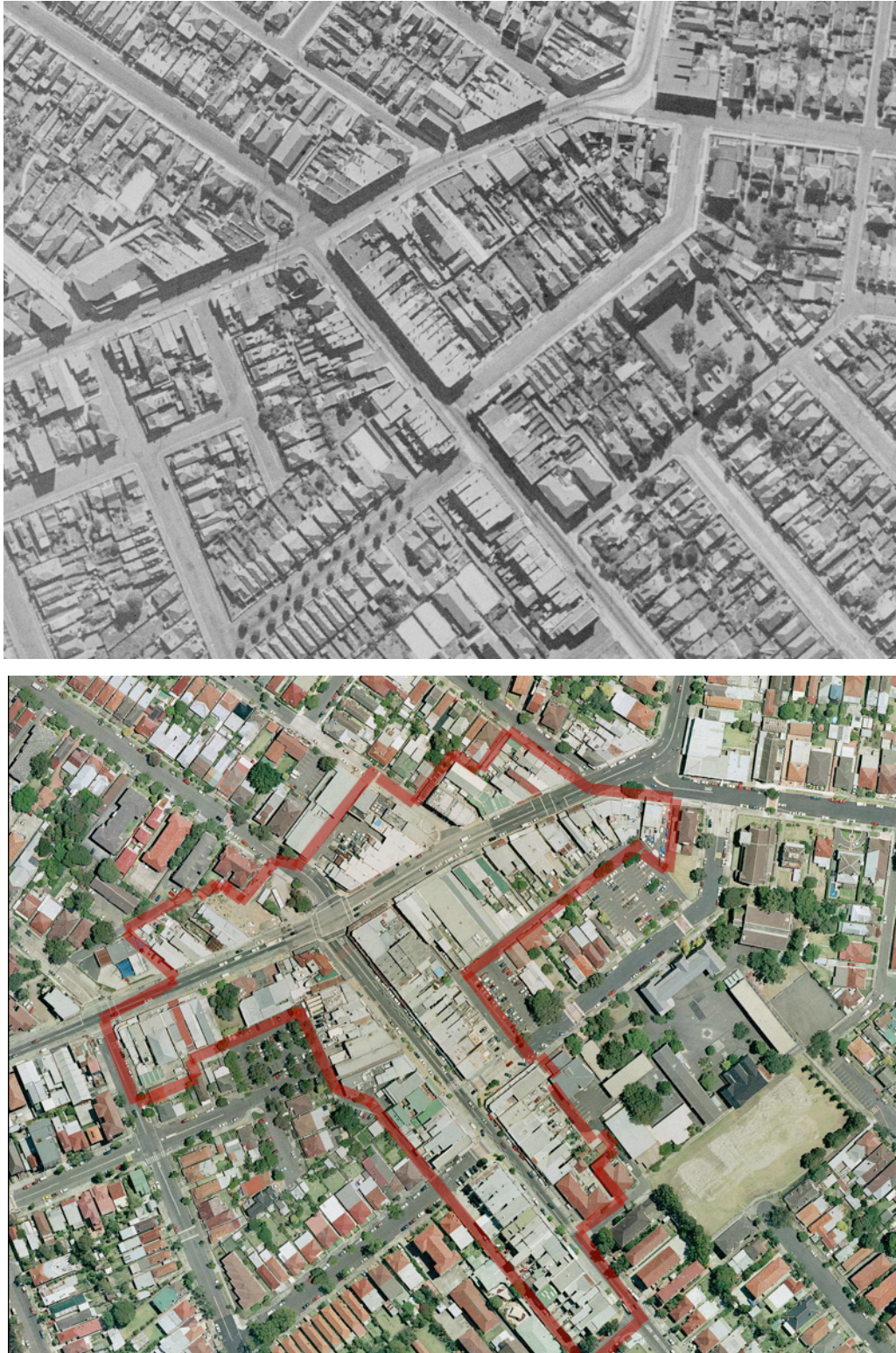
Figure 28.2 The Area in 1943 and 2009

The Dulwich Hill Commercial Precinct Heritage Conservation Area follows the alignment of New Canterbury Road between Constitution Road/Beach Street and Herbert Street and Marrickville Road from its intersection with New Canterbury Road to Macarthur Parade.