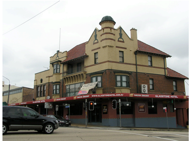
Figure 28.7 and 28.8. The intersection of New Canterbury and Marrickville Roads is punctuated by the Gladstone Hotel (R) and a commercial building with a similarly formed parapet line (R) which enhance the streetscape qualities of this busy intersection.