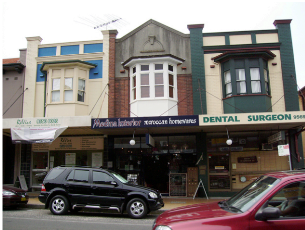
Figure 28.3. Group of substantially intact (above awning) shops on Marrickville Road

The following figures illustrate the main elements and characteristics of the Dulwich Hill Commercial Precinct Heritage Conservation Area.