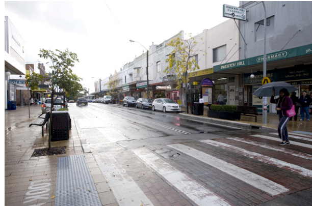
Figure 28.13 and 28.14. The parapet line throughout the shopping centre is consistently two stories in height with decorative detailing varying according to the underlying built form and period of construction of the relevant group of buildings.