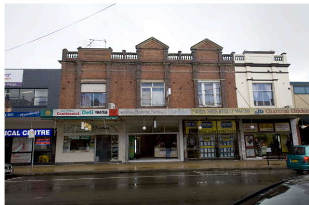
Figure 28.17. Parapet detail on Marrickville Road