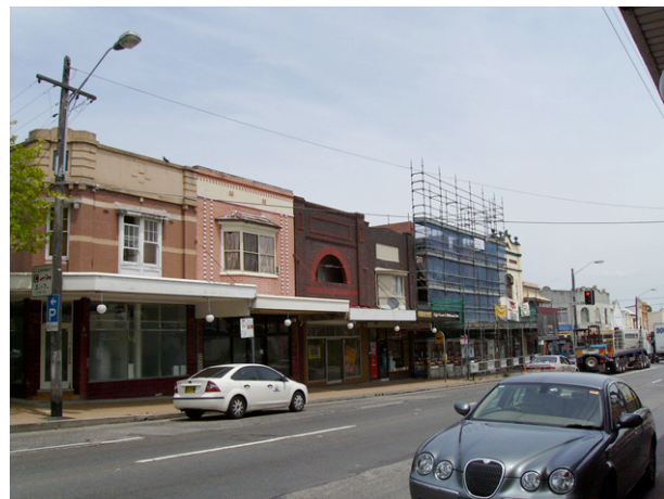
Figure 28.16. Marrickville Road. This group demonstrates considerable variation within the detailing of the façade but a consistent parapet height.