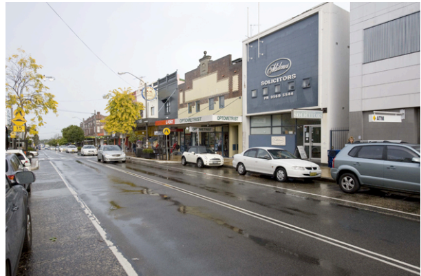
Figure 28.9 to 28.17 show some of the contributory parapet lines found in the Area.