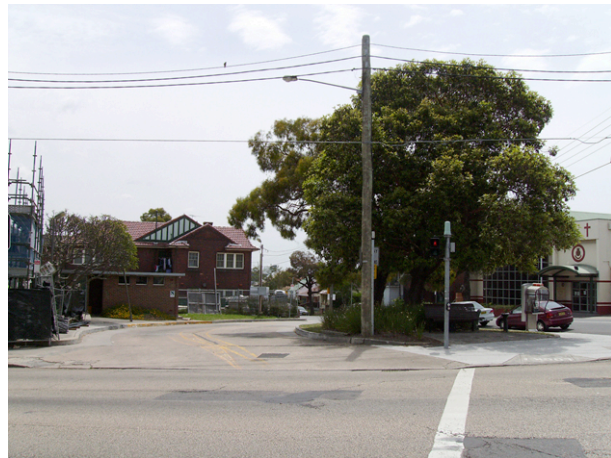
Figure 28.4. The Dulwich Hill shops developed after the arrival of the tram service along Marrickville Road which terminated within the area now used as a bus turning circle. This space is important to understanding the significance of the area.