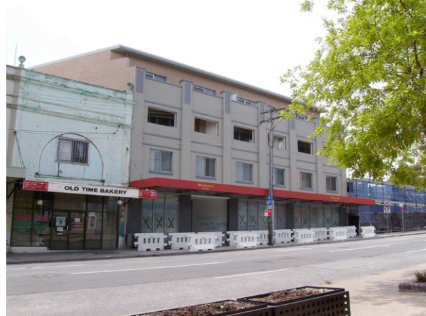
Figure 28.19. This recent infill development has attempted to replicate the rhythm of the original shop bays whilst also achieving additional levels. Its success from the streetscape perspective is limited because the additional level setback from the main parapet obstructs the variations created along the new parapet line.