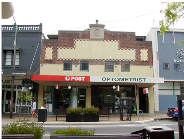
Figure 28.16 Parapet detail on Marrickville Road